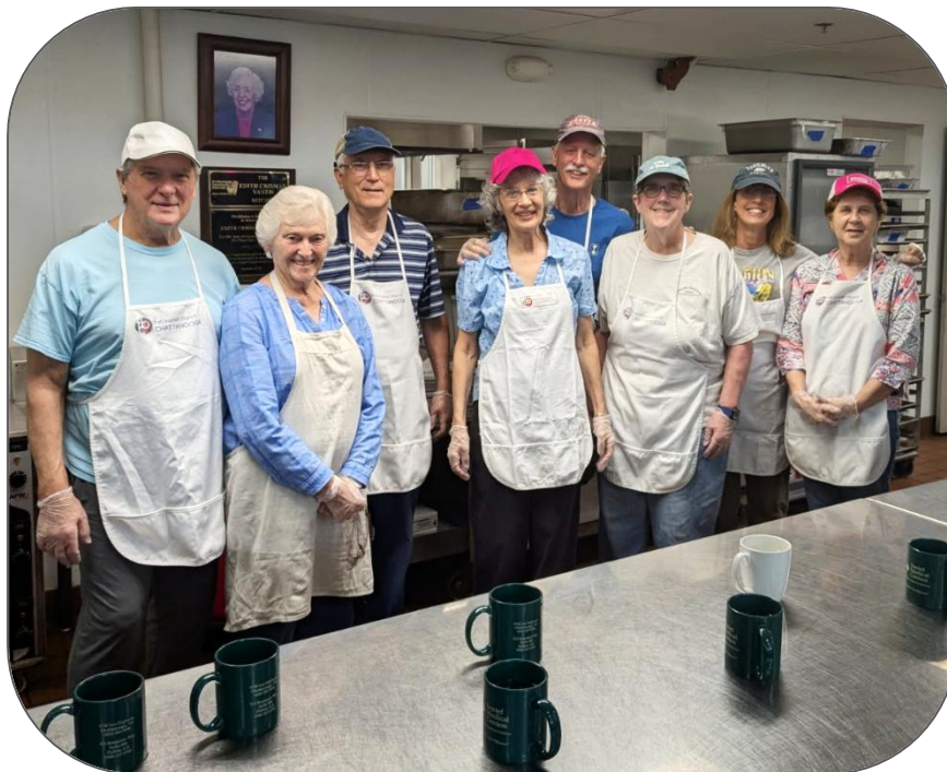
FBC Volunteers for the CHATT Foundation – 1 st and 3 rd Wednesdays