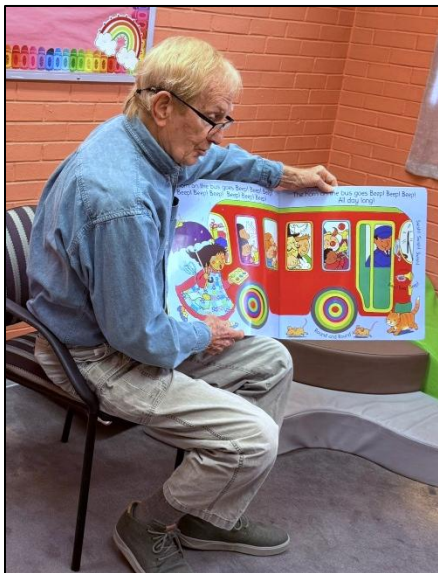
Herb reading to children at Newton Child Development Center.