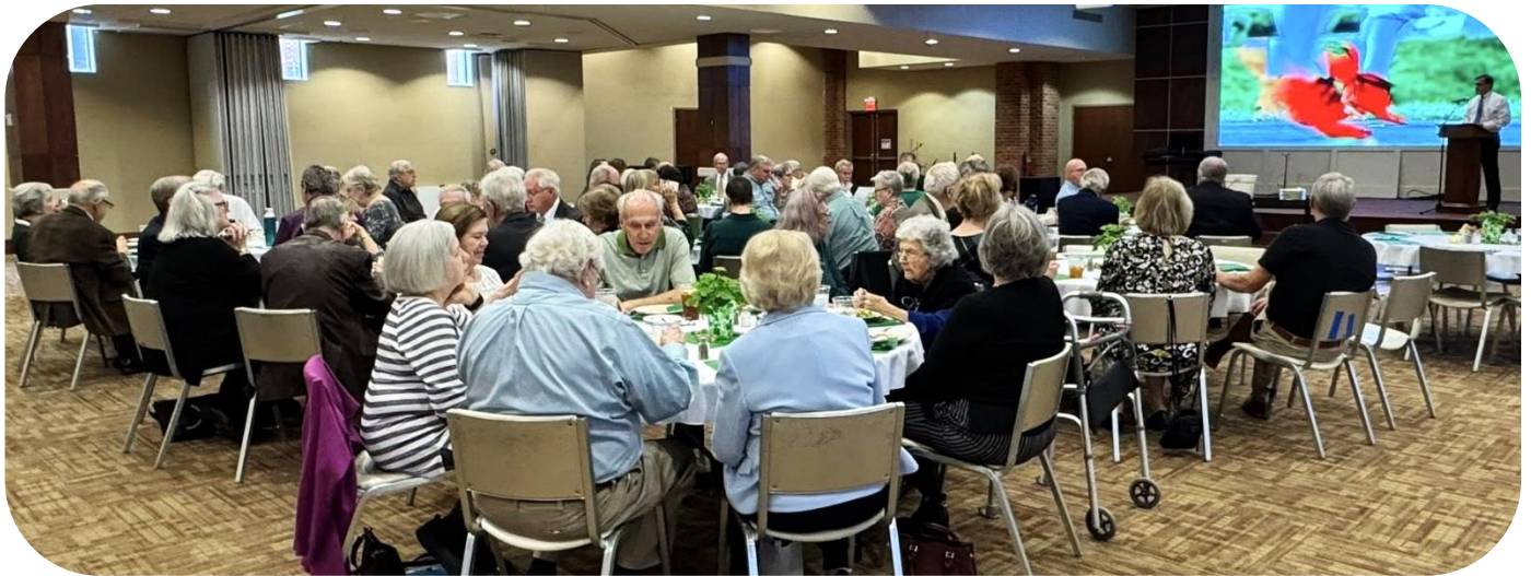
Adult Ministry Luncheon, March 15

Ready for the Gong Show (March 8) to begin! More photos coming!