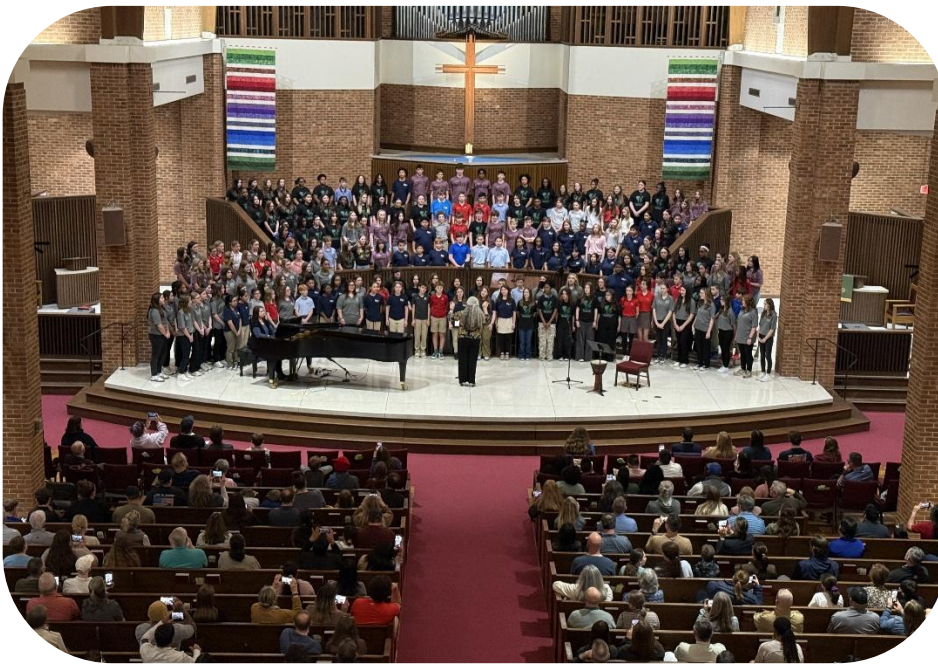
The Chattanooga Area Middle School Choral Festival, February 10, was a daylong event held at FBC, sponsored by the Chattanooga Boys Choir, and culminating in a wonderful concert.