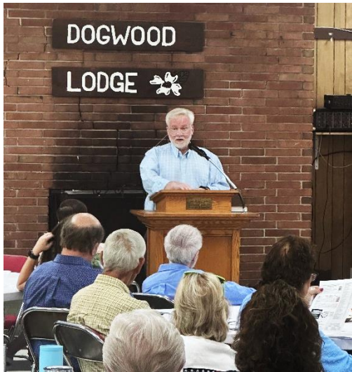
Worship at Dogwood, August 31.