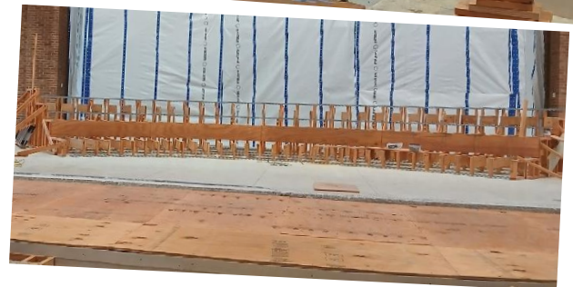
The Sanctuary Chancel – Work on the Choir Loft