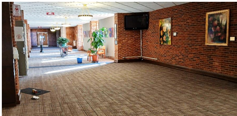
New carpet in the Lobby!